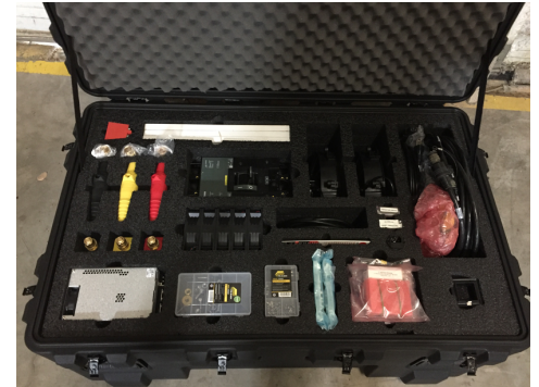
KMS-5100-100 transmitter spares kit (left); KMS-5100-150 transmitter spares kit (right)